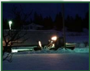
Roger in the Kubota RTV.

Long before most of us arrive on campus, the Physical Facilities Grounds Crew is busy plowing, shoveling, chopping and removing snow and ice. They clear parking lots, sidewalks and stairs on campus and at the Greens . Keeping the campus clear of snow and ice is often a six-day-week job for Roger St. Aubin and Scott Schendel. They sometimes come in as early as 4:00 a.m. if we have a big snow storm. They also help out the crew at Highlands College when needed.