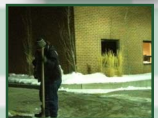
Craig chipping ice.